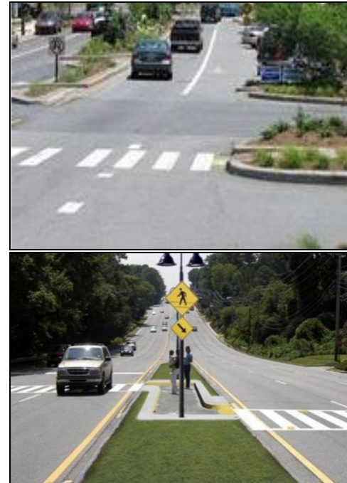
Curb extensions / Staggered median crossings