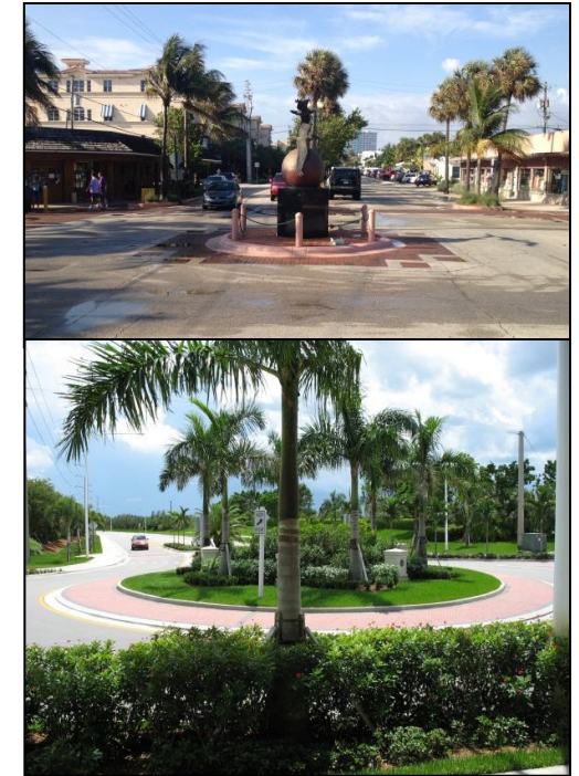
Traffic circles / Roundabouts